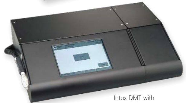
Intox DMT with optional dry gas compartment